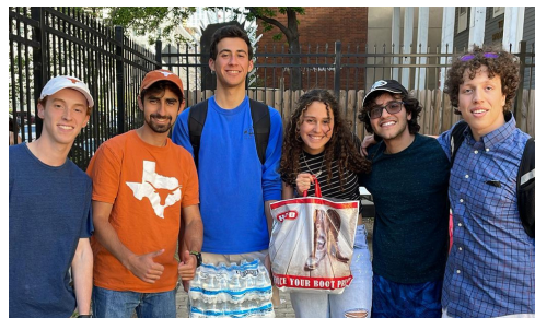
JTribe members geared up to volunteer for the homeless