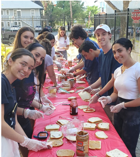
Making PB&J sandwiches for the homeless