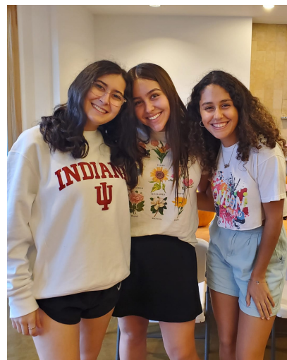
President, Jewish Chair and Networking Chair prepare for their first event