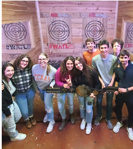
Axe throwing was a first for many at JTribe's kick-off event