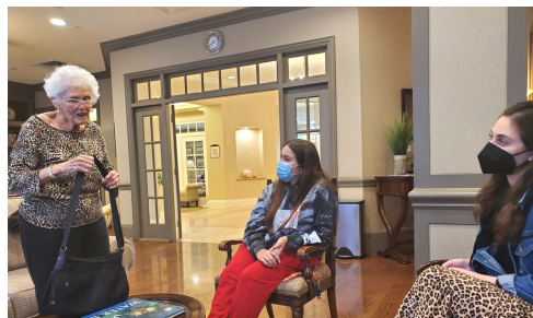
Delivering homemade challah to Jewish senior residents