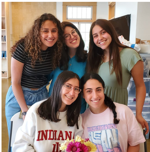
End-of-year Board appreciation brunch

The members receive experiences that engage with the community, enrich their connection to Judaism, and encourage them to take leadership.